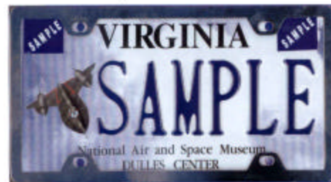
LEGAL LICENSE PLATE HOLDER