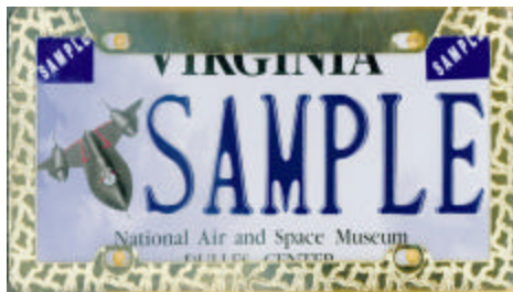
ILLEGAL LICENSE PLATE HOLDER

In an effort to ensure that your customers do not encounter difficulties with law enforcement, please ensure that any license plate holders placed on vehicles sold by your dealership conform to these new regulations.